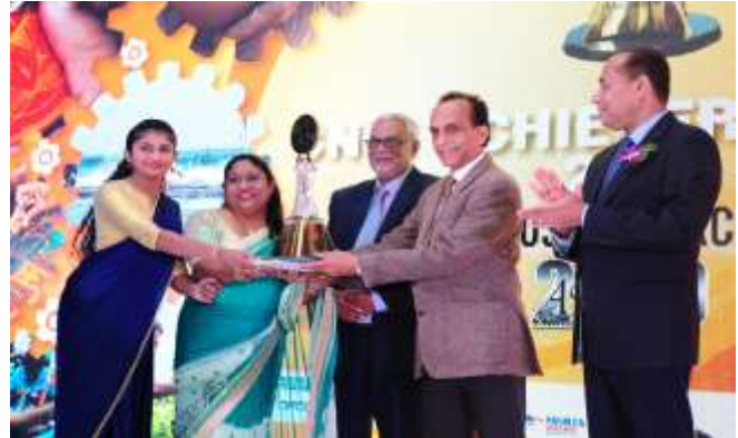
Manisha Auto Engineers bagged the Crystal Award at the CNCI Achiever Awards 2019 at the Small Category– National Level, Manufacturing Sector