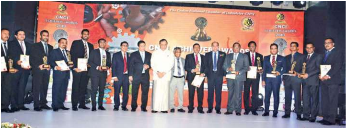
The top 10 CNCI award winners.

The important and vital policies on national interest, taken by respective governments should not be changed under any circumstances by governments which come into power on the grounds that it badly affects the country's entrepreneurs, Speaker Karu Jayasuriya said.