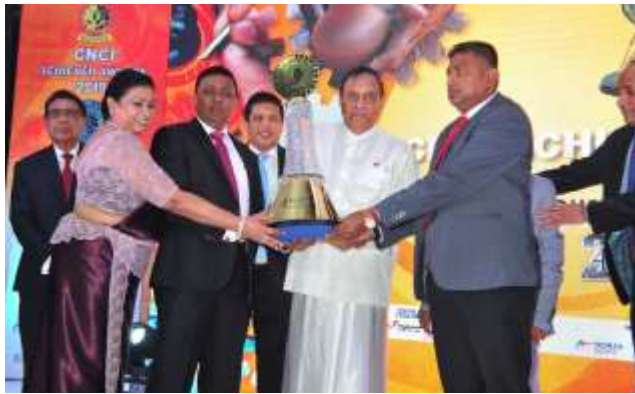
SAW Engineering (Pvt) Ltd bagged the Crystal Award at the CNCI Achiever Awards 2019 at the Extra Large Category– National Level, Service Sector